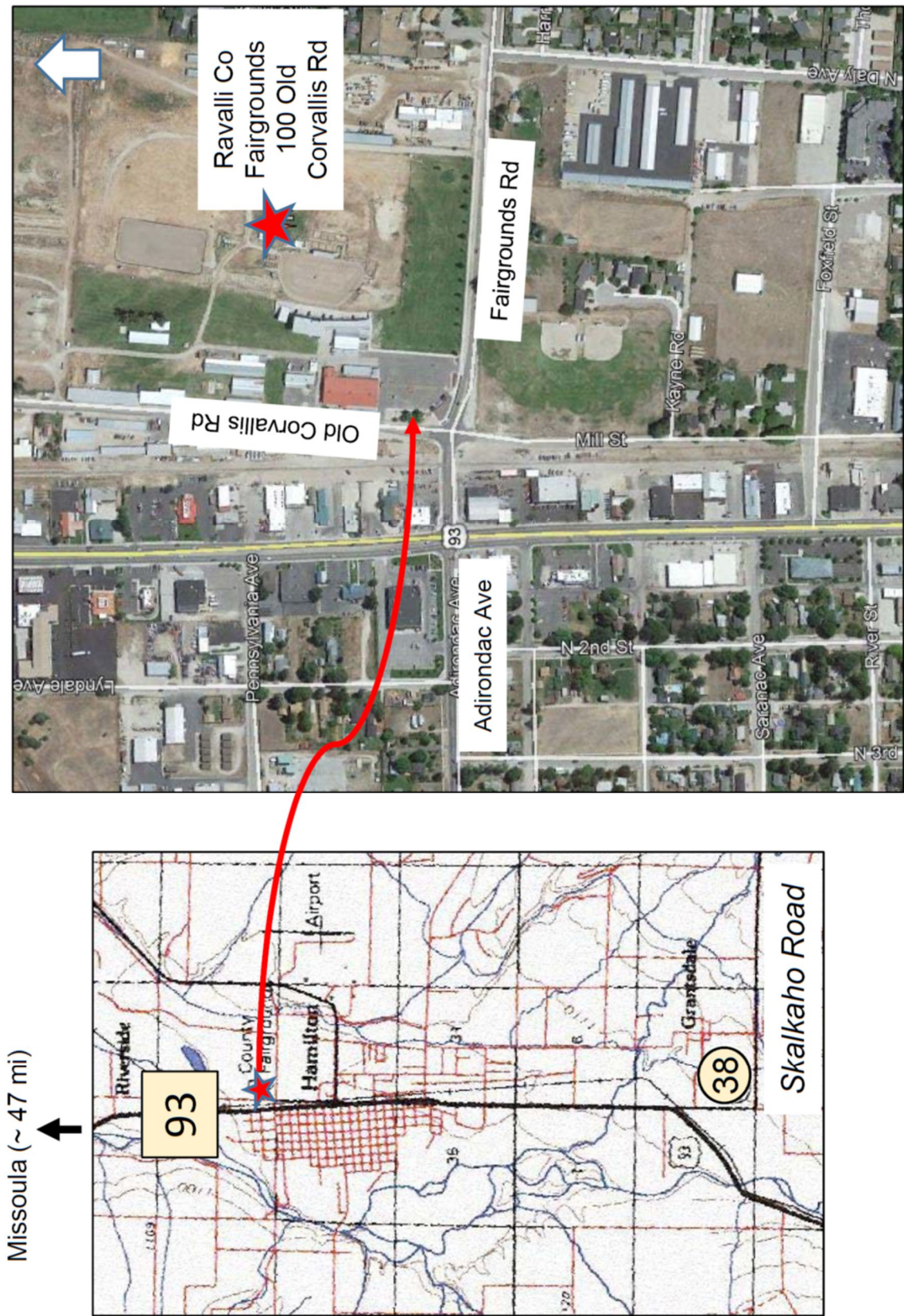
Hamilton Area Maps and Fairground layout: