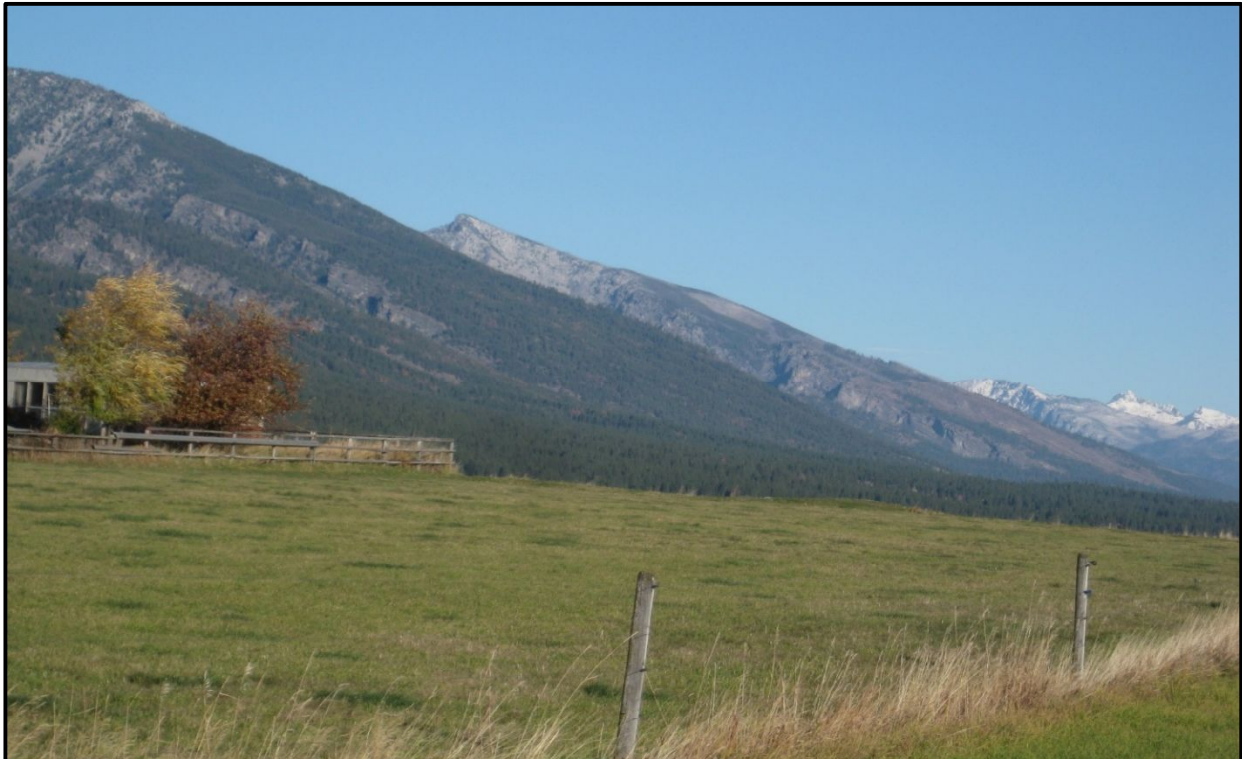
Flat irons marking the Bitterroot Detachment surface (Jeff Lonn)

TRGS will hold its 45 th Annual Field Conference in Hamilton, Montana July 23–27, 2020. The Bitterroot region's geology is complex and diverse, ranging from 2 billion-year-old basement to late Quaternary fault scarps. Field trips to nearby mineral resource localities include the Crystal Mountain fluorite mine, the Lower Willow Creek porphyry deposit west of the Black Pine Mine, and recreational sapphire mining from the alluvium along the West Fork of Rock Creek in the Sapphire Mountains. Field trips will examine thrust faults, basement and Belt rocks of the Sapphire Mountains, late Quaternary fault scarps along the Bitterroot fault, and the valley's glacial features. Conference organizers are Jeff Lonn and George Furniss.